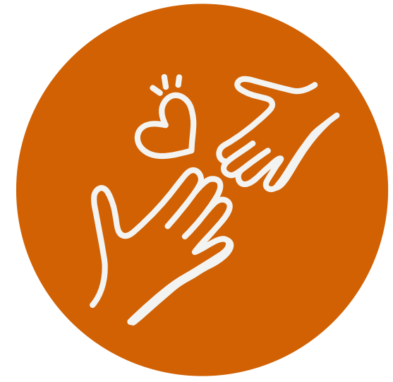
CARE @ WORK*