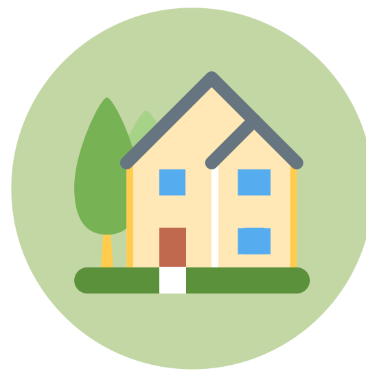
IN-HOME CHILD CARE/BABYSITTERS