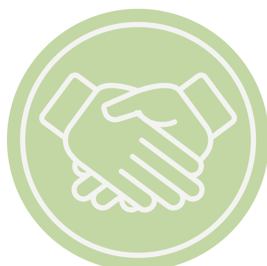
NANNY PAYMENT SERVICES