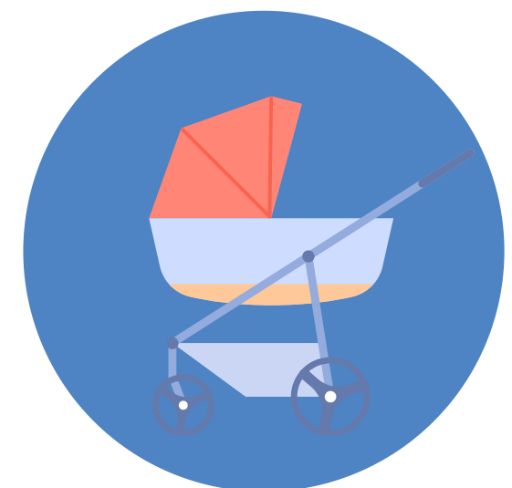
NANNIES & BABYSITTERS