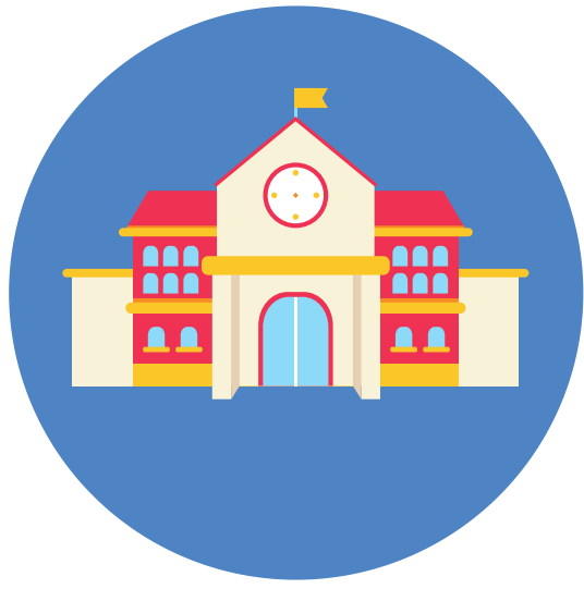
ON-CAMPUS CHILD CARE

Finding reliable caregivers is important to working parents. Harvard University provides access to a variety of child care options. Explore your options and resources below: