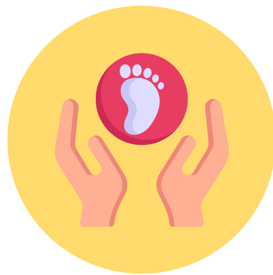
OFF-CAMPUS GROUP CHILD CARE