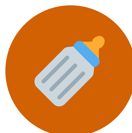
LACTATION SUPPORT, PARENTING SUPPORTS