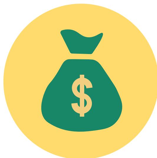
FINANCIAL ASSISTANCE FOR CHILD CARE*