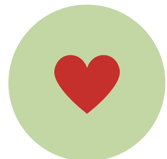
HARVARD'S EMPLOYEE ASSISTANCE PROGRAM (EAP).*