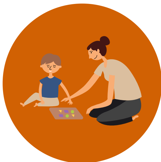
NANNY PLACEMENT SERVICES