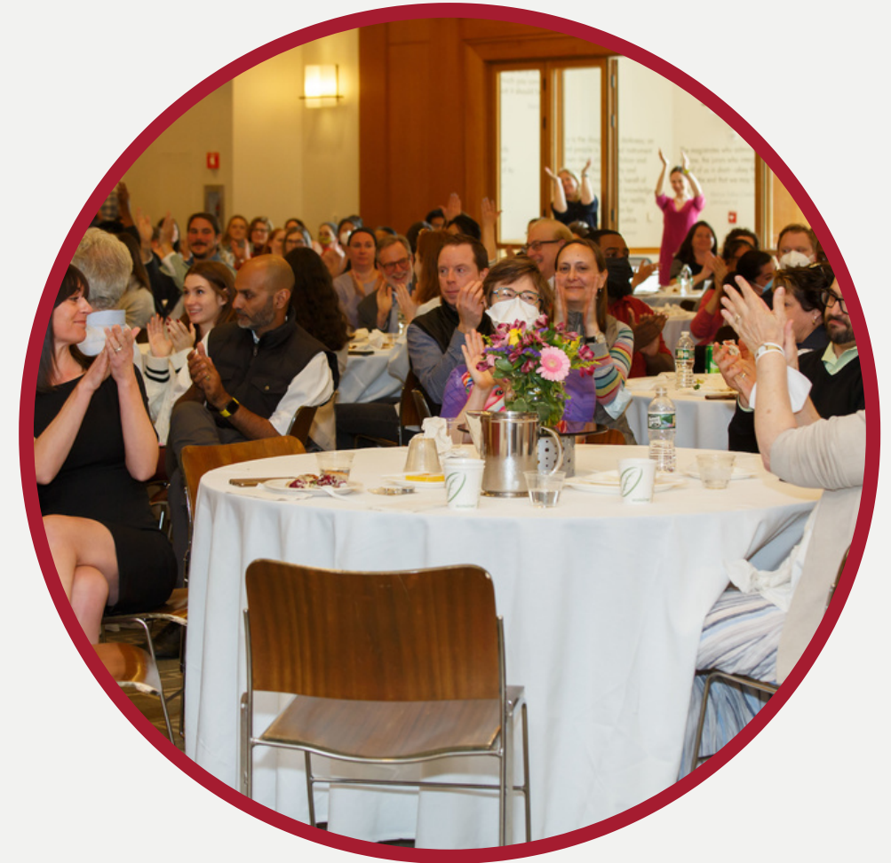
Staff Appreciation Lunch