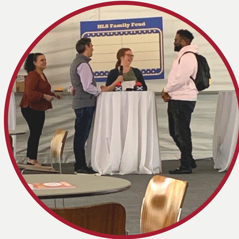
Fridays @ 4 'Family Feud Edition'