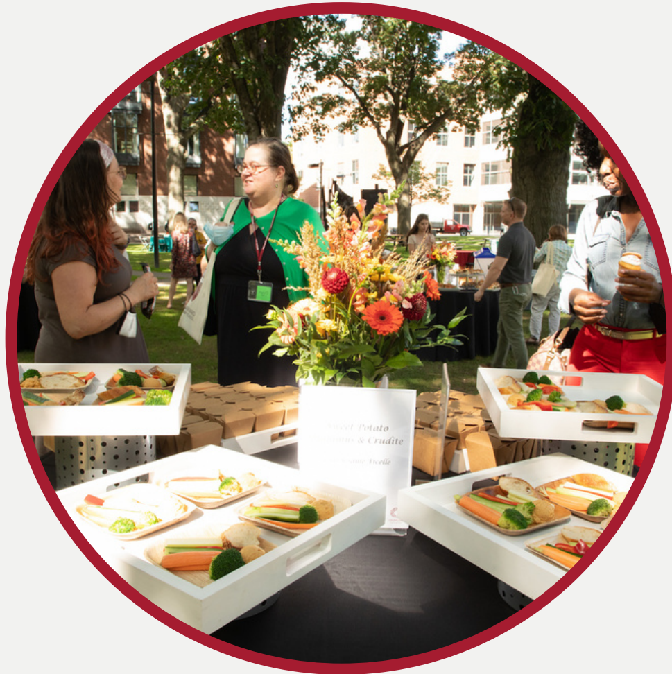
HLS Staff Party

We strive to cultivate an engaging and inclusive culture where people feel connected and celebrated.