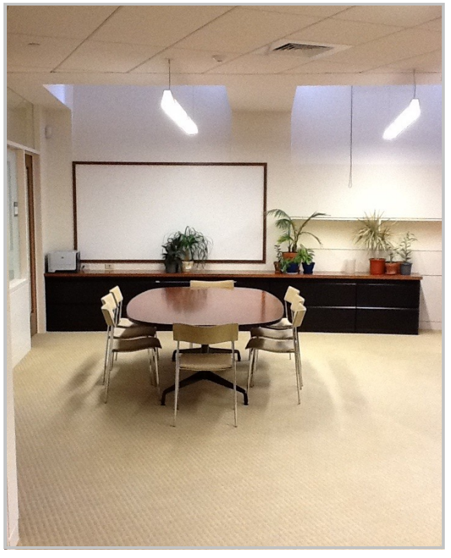
HLS Financial Office, Finance Workroom Photo: Elaine Construction , 2012.

In a below-grade space that receives little daylight, the project team worked to balance efficiency, function and comfort by utilizing various lighting types (LEDs, high efficiency linear fluorescents, task lights, etc), as well as interior partitions with transparent glazing to maximize light transmission through the spaces.