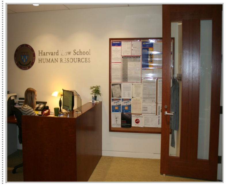
HLS Human Resources Office - Reception