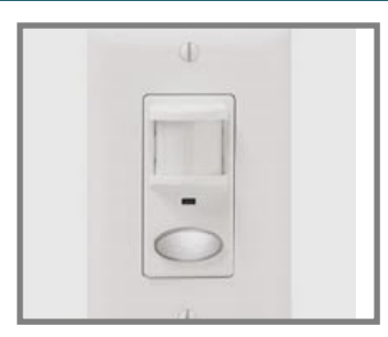
Wall Mounted Sensor—WSD Sensorswitch