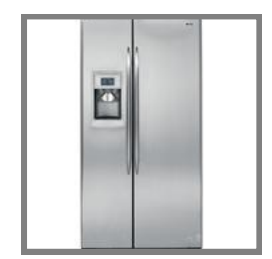
Side by Side Refrigerator Model #PFSS5NFZ GE Profile

100% of the equipment purchased for the project is ENERGY STAR RATED (by rated power).