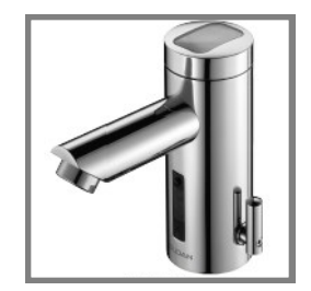
Solar Powered Sensor Faucet Model #EAF-275 Sloan

✓ 0.125 gallons per flush (gpf) vs. EPAct baseline of 1.0 gpf.