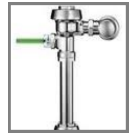
Manual Dual Flush Flushometer Model #WES-111 Sloan

36% reduction in annual water use (12,280 gallons/year projected savings) when compared to EPAct 1992 baseline standard