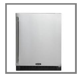
Undercounter Refrigerator Model #6ADAM