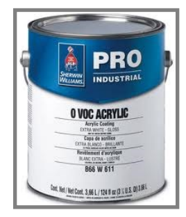
ProMar 200 Zero VOC Sherwin Williams

√ VOC Content = 0g/L vs. 65 g/L VOC Limit